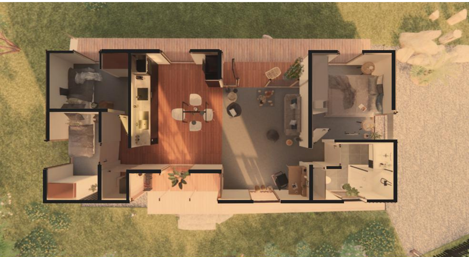
Three bedroom plan