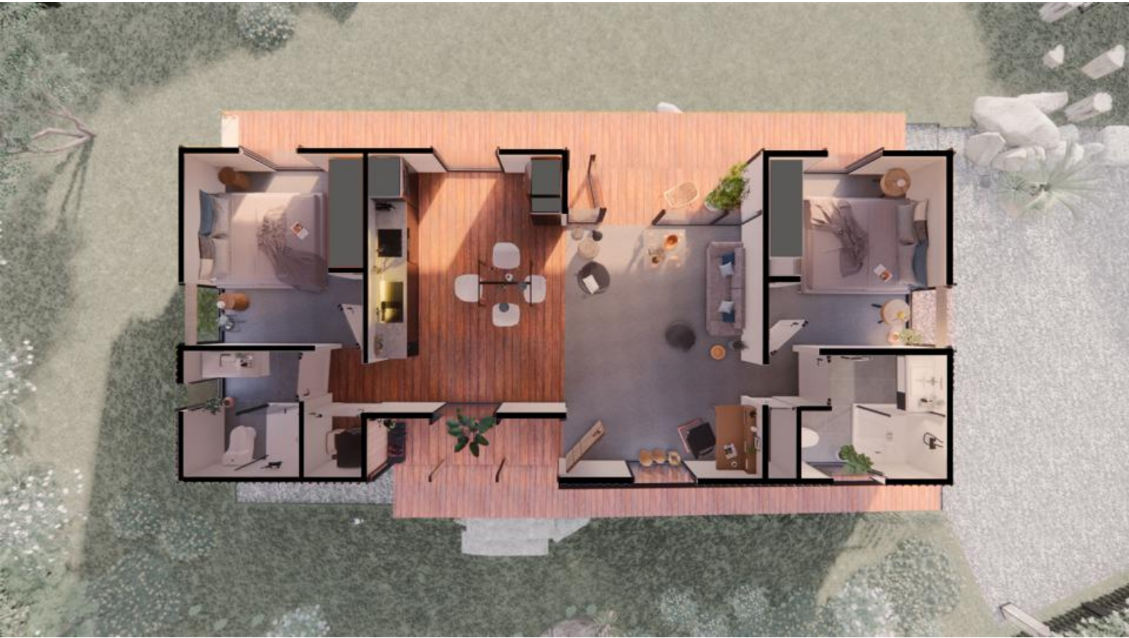
Two bedroom plan